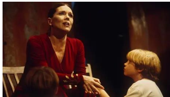
Playing Medea , at the Almeida theater, London.

...The sixties marked the end of Diana Rigg's global fame, however, the screen's loss was the stage's gain, for in the coming decades she would focus extensively in theatre, receiving critical acclaim for her turn as French writer Sidonie Gabrielle Collette in Collette - 1982, and, as the titular character in Medea , for which she received her third Tony award in 1994.