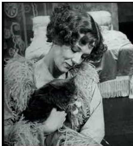
As, Collette, during an American theatre tour

She would also feature prominently in television over the years, winning an Emmy for her chilling depiction of the diabolical Mrs. Danvers in a 1997 adaptation of, Rebecca . In later years, Dame Diana would earn a whole new generation of fans when in 2013 she was cast as Olenna Tyrell in Game of Thrones . Rigg confessed she'd never heard of the show prior to being cast, yet, attested she had fond memories of her four seasons playing the scheming, witty matriarch.