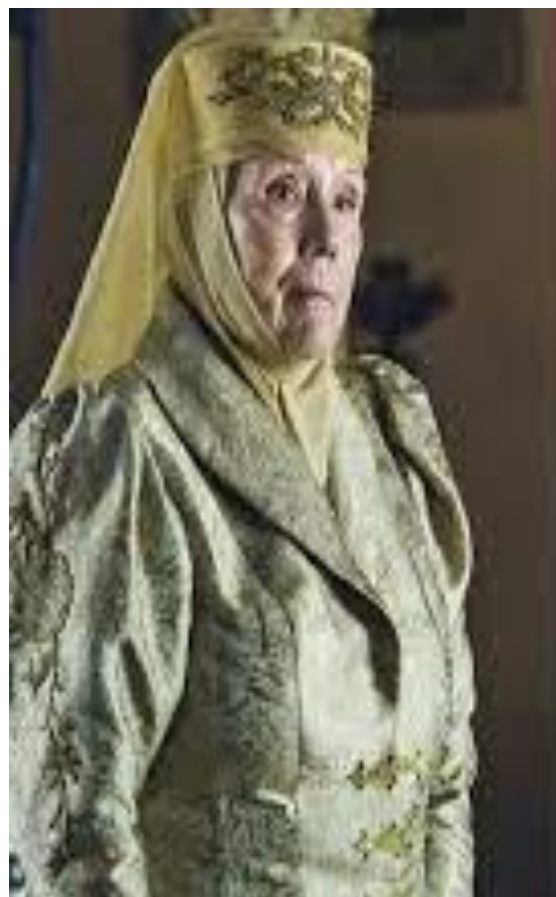
Queen of the Screen, Dame Diana as Olenna Tyrell

She would also feature prominently in television over the years, winning an Emmy for her chilling depiction of the diabolical Mrs. Danvers in a 1997 adaptation of, Rebecca . In later years, Dame Diana would earn a whole new generation of fans when in 2013 she was cast as Olenna Tyrell in Game of Thrones . Rigg confessed she'd never heard of the show prior to being cast, yet, attested she had fond memories of her four seasons playing the scheming, witty matriarch.