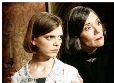
As the twisted gatekeeper- Mrs. Danvers, in Rebecca