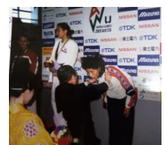
Hillingdon's own, Karate kid